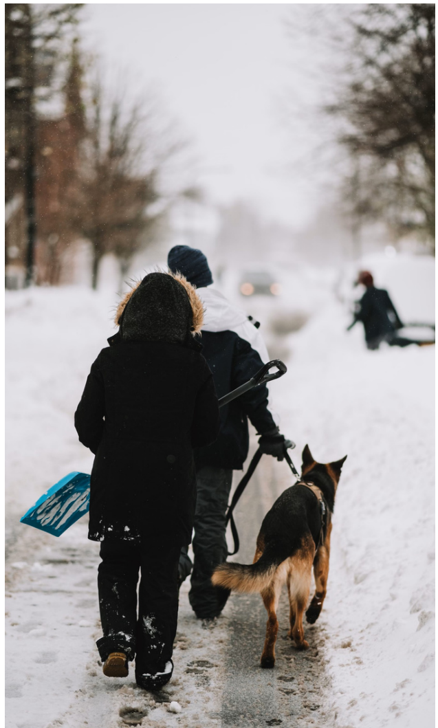
Pedestrians walking a dog in the street

The events of the November snowstorm and December Blizzard of 2022 have shown that the challenges Buffalo faces in terms of snow are not going away any time soon. If the status quo holds, those who rely on sidewalks to get around will continue to find themselves trapped or forced to put their bodies at risk by braving the ice. Individual acts of charity are inspiring and commendable, but there must be a collective, municipal response. Only the city of Buffalo, empowered by and accountable to all Buffalonians, has the resources and capacity to successfully deal with this pedestrian crisis.