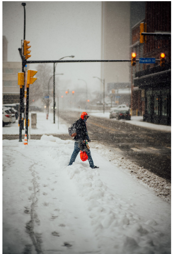
Pedestrian preparing to cross the road

Burlington conducts sidewalk clearing operations concurrently with street and bike lane snow removal operations. Burlington primarily uses plow tractors to remove small amounts of snow, however when snow banks build too high for plows and tractors to be effective, city employees use standard snow plows to clear each sidewalk. Along with snow removal activities, city employees continuously scrape ice from, and apply de-icing agents to sidewalks throughout the winter season to prevent the accumulation of ice and packed snow. City employees maintain an extra emphasis on sidewalks in heavy pedestrian corridors such as the downtown and schools and their adjacent lots. Employees often begin snow and ice removal operations as early as 3AM to ensure that children are able to safely walk to school.