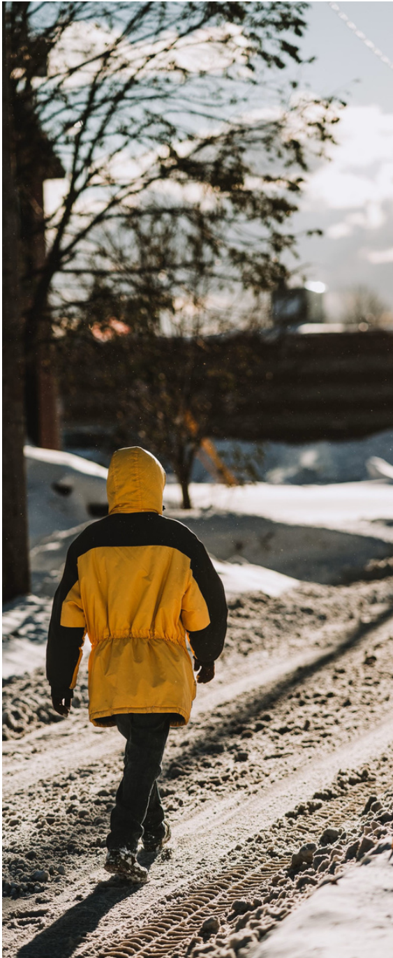
Pedestrian walking in the street