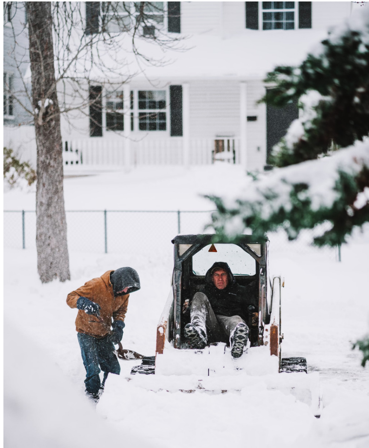
Homeowner using a pedal powered snow pusher

It has not worked, and continues to not work. Absent landlords fail to clear their sidewalks, or rely on management companies not based in the city who only arrive days later. Private citizens often do not have the means or time to clear sidewalks on top of their already busy lives. In addition to sidewalks, bus stops remain inaccessible, leading to people walking in the streets , making already treacherous driving conditions even more dangerous. When one third of the city relies on the city's sidewalks to access it, and even more rely on public transportation, this is unacceptable.