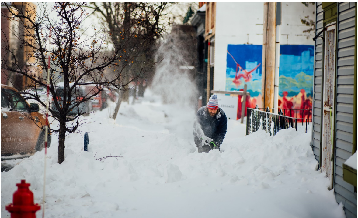
Business owner using a snowblower

This report is two-fold. Firstly, it aims to frame the problem of lack of sidewalk snow removal as relevant and requiring remedy. Secondly, it also offers solutions as to how such a plan may be implemented. The problem is clear: a lack of sidewalk snow removal hinders working class Buffalonians without a car from access not only to work, but also necessary services. Solutions differ from municipality to municipality, both in scope and cost. One fact is indisputable, though: in almost every city which receives significant snowfall in North America, some plan exists to not only clear snow from roads, but from sidewalks as well. The city of Buffalo must follow suit, joining other cities across upstate NY and North America, and implement their own plan for sidewalk snow removal.